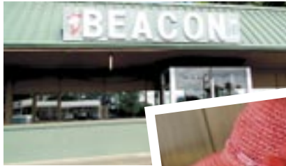
The Beacon Restaurant